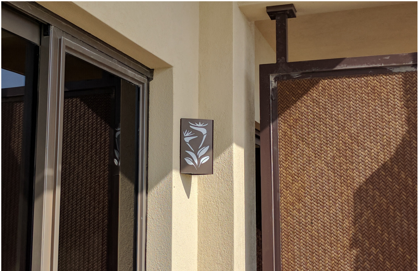
Avaiki / Hotel, Singapore