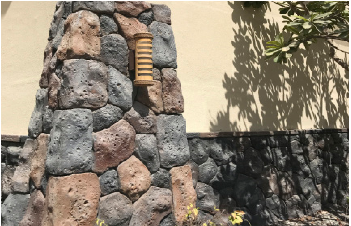
Jamaica C / Lapita Hotel, Dubai