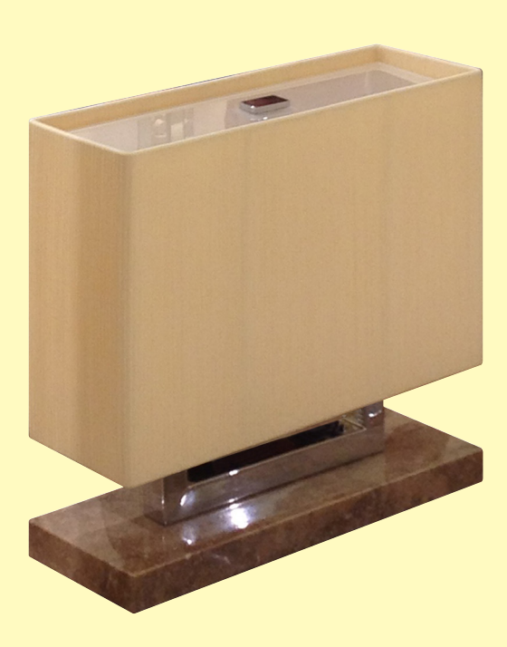
Miami Table Marble