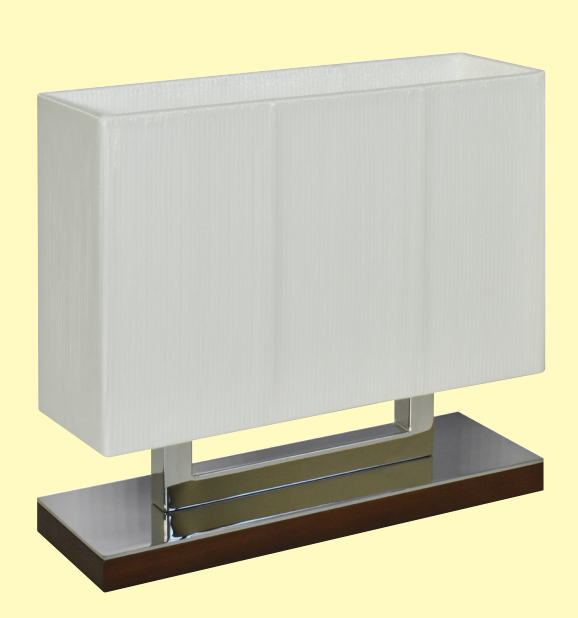
Miami Table Wood