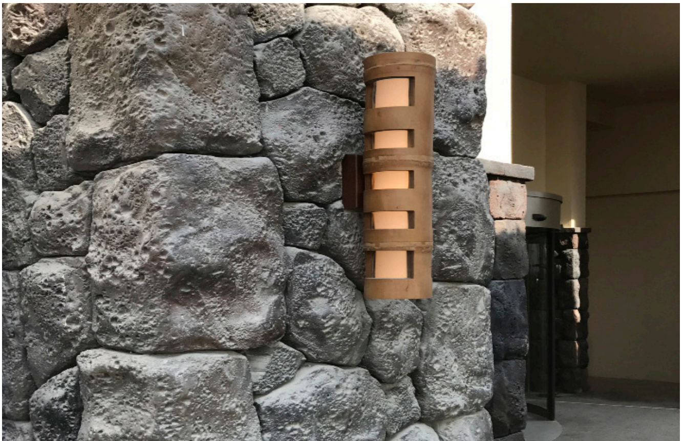
Jamaica B / Lapita Hotel, Dubai